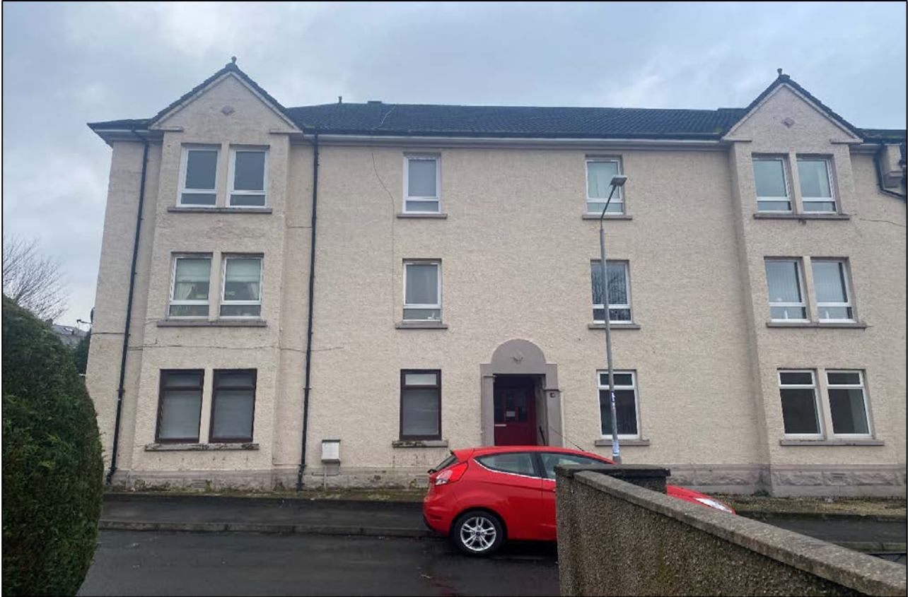
View of 4F Margaret Street, Gourrock from the front

benefits. Policy 20 of the proposed LDP requires the proposal to be assessed with regards to the impact on the amenity, character and appearance of the area. The flat is within a residential area where it is acknowledged that there is a loss of one residential unit arising from the use, however, visitors using the flat are likely to contribute to the vitality and viability of the local economy. It is considered that the economic benefits of this use outweigh the loss of one residential unit. The use therefore accords with Policy 30 of NPF4.